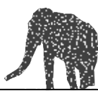
Packy (54), male Diagnosed: 2013 Died: 2017