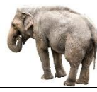
Shine (36), female Diagnosed: 2017