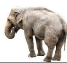
Shine (36), female Diagnosed: 2017