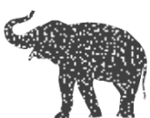
Rama (31), male Diagnosed: 2013 Died: 2015

The latest victim is Chendra (26) , who miscarried after being kept isolated